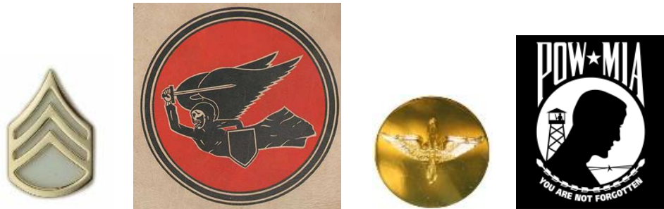
Patch for 83 rd Bombardment Squadron

U.S. Army Air Corps – 9 th Air Force 83 rd Bombardment Squadron Staff Sergeant Missing In Action – July 10, 1944 – Tunisia