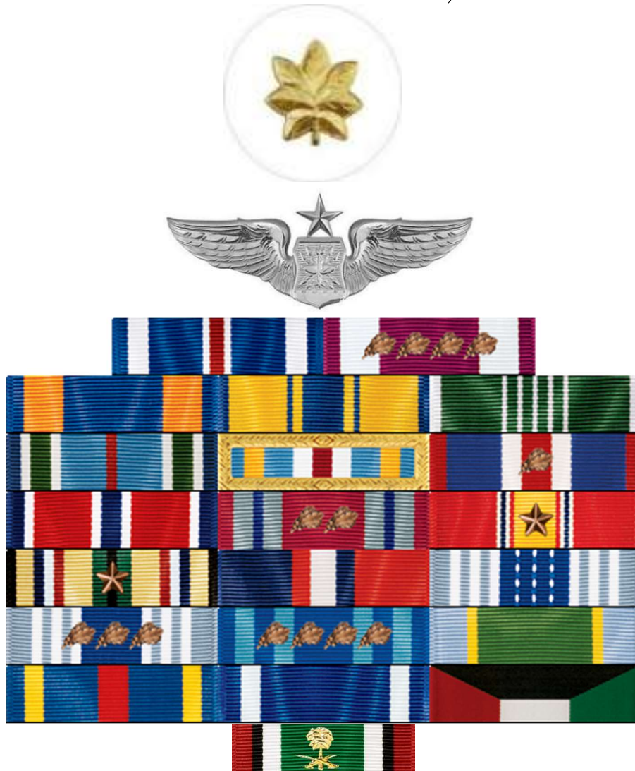
Force Navigator Badge