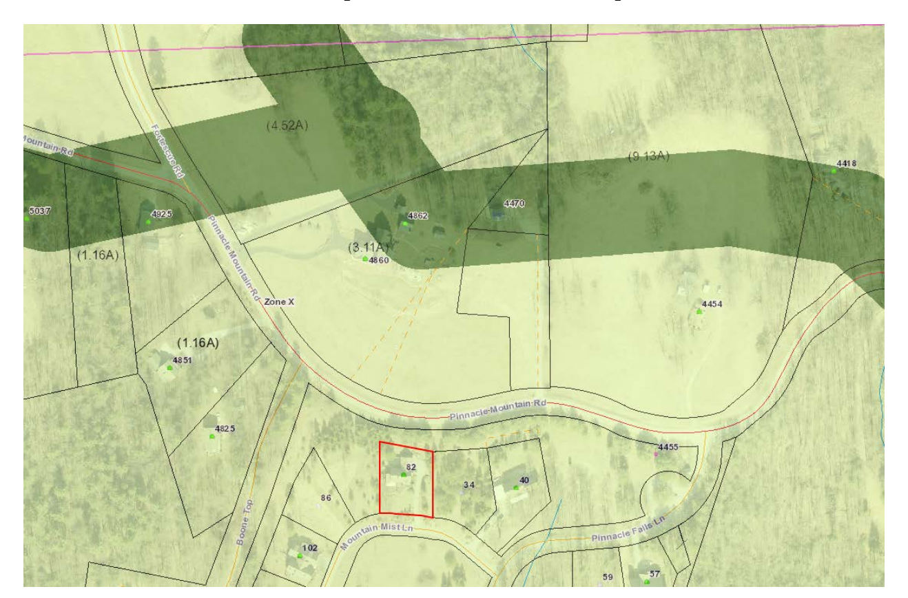
Map C: CCP Future Land Use Map