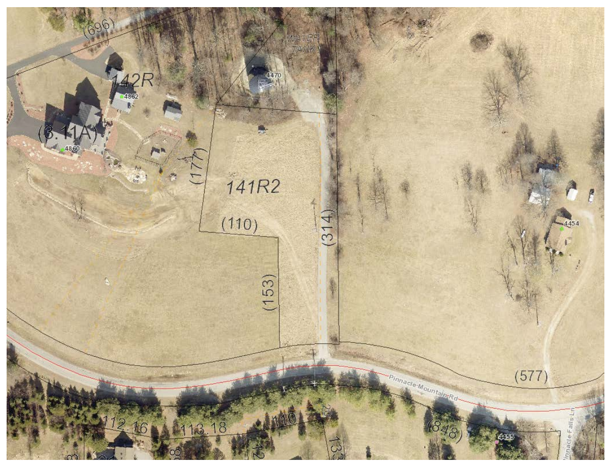
Map A: Aerial Photo/ Pictometry