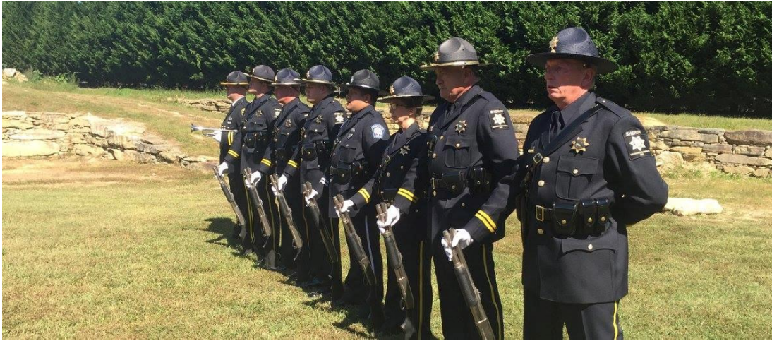
Henderson County Honor Guard