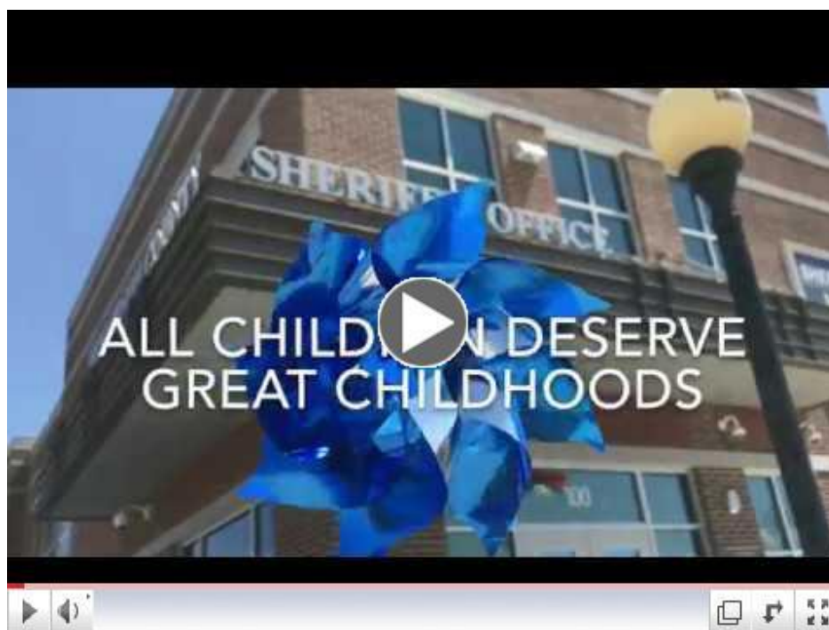
Pinwheels for Prevention