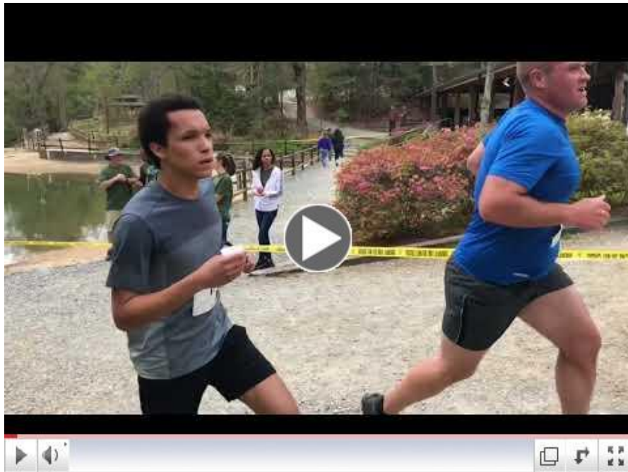
Camp STAR 5k Trail Run Montage

More information on the Sheriffs Teaching Abuse Resistance (STAR) program can be found on the Sheriff's Office website .