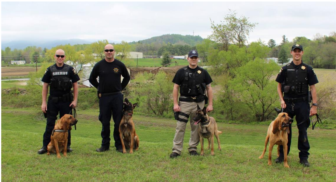
K9 Demonstration at the Edneyville Community Center