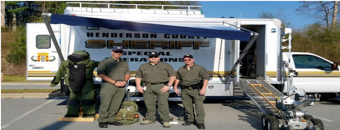
3/5 of the Henderson County Sheriff's Office Bomb Squad