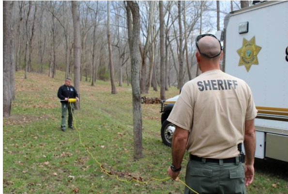
Deputy Ridgeway & Dudney set up for a NCJA Hazmat course

demonstrations to educate fellow law enforcement and the general public about what they do and the equipment they use.