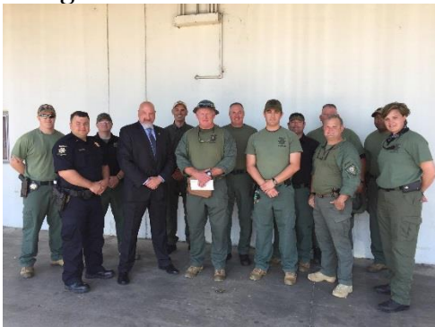
Greenville County's Bomb/Arson Team with HCSO members at regional training

The HCSO Bomb Team trains locally as well as participating in regional training.