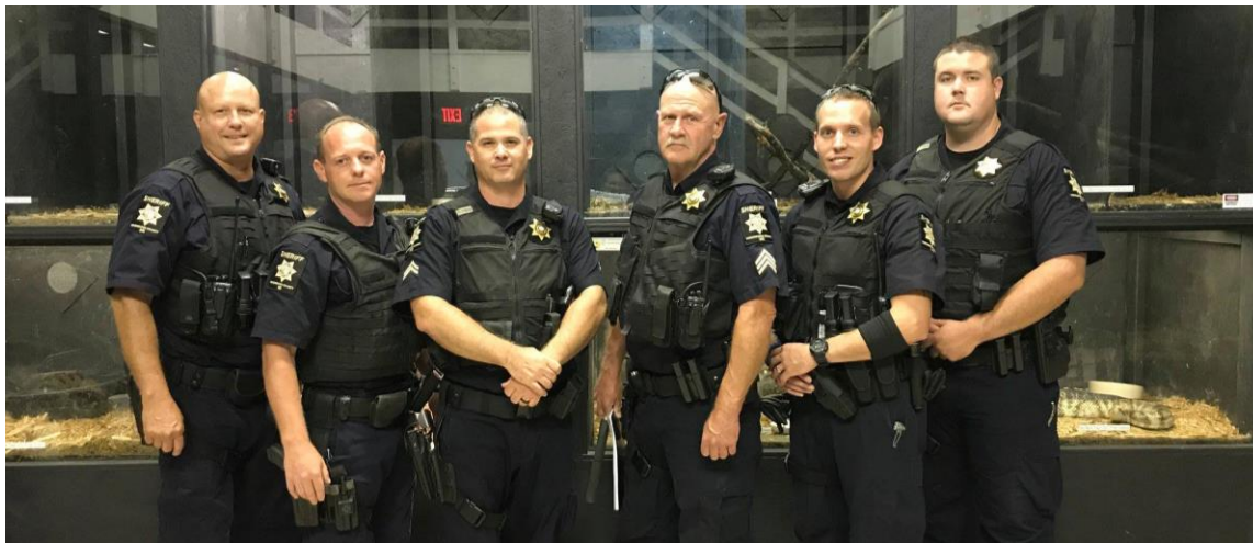
Members of the HCSO Animal Enforcement Team