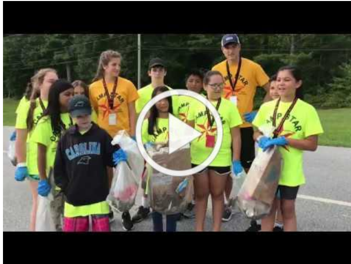
Camp STAR 2018 Service Project

fun when Hendersonville Elementary School and Bruce Drysdale students were in attendance at camp.