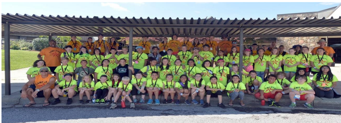
Camp STAR campers, counselors and School Resource Deputies