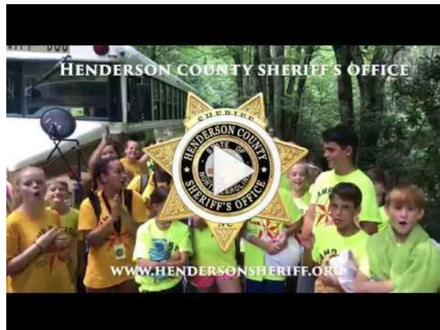
Overview of Camp STAR 2018

486 5th grade students were invited to attend Camp STAR over five sessions occurring throughout the summer. School Resource Deputies who also teach the STAR (Sheriffs Teaching Abuse Resistance) program in fifth-grade classrooms, head up the camps. They are assisted by approximately 70 volunteer high school counselors. School Resource Officers from the Hendersonville Police Department also joined in the