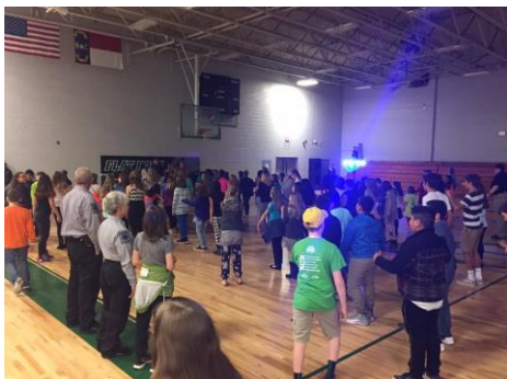
The gym converted to a dance floor

In order to raise funds for Camp STAR (read more in the August 2016 Guardian ) and provide 5th grade STAR students with a fun after school activity, School Resource Deputies have been hosting STAR Jams at Flat Rock Middle School. These dances include a DJ, free throw competitions, concessions and the opportunity for kids to hang out with their friends and interact with law enforcement in a fun and positive way outside of STAR classes. Over six hundred students have attended the two STAR Jams held in 2017.