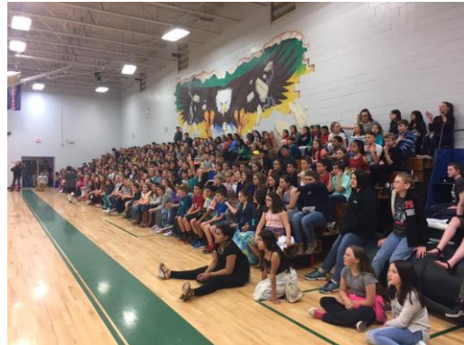
Students waiting to hear who won