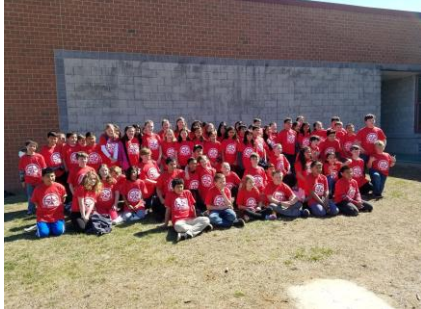
Upward Elementary STAR graduates wearing their STAR shirts

We applaud our School Resource Deputies for equipping kids with important information and for being role models and allies as they head into middle and high school.