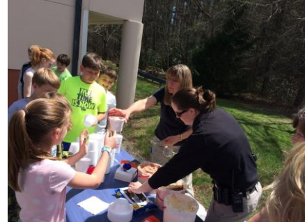
Atkinson Elementary's ice cream social celebration for STAR graduation