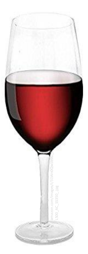
about 12% alcohol