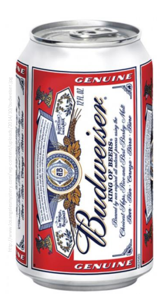
about 5% alcohol