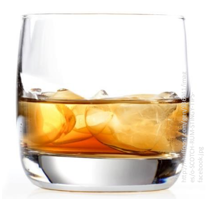
about 40% alcohol