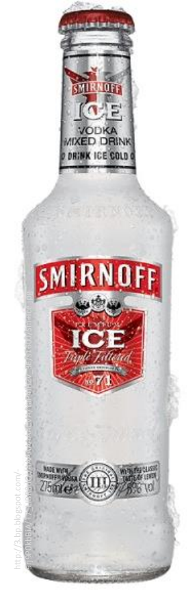
about 7% alcohol