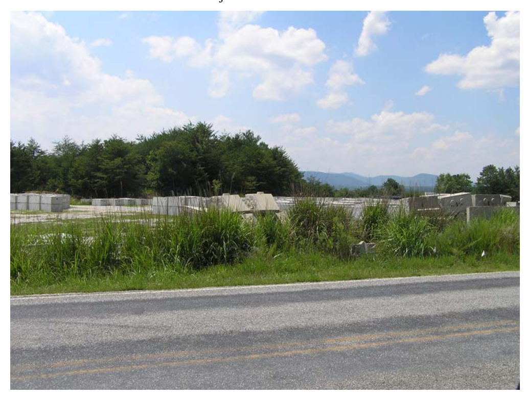
View of vacant tract to the north