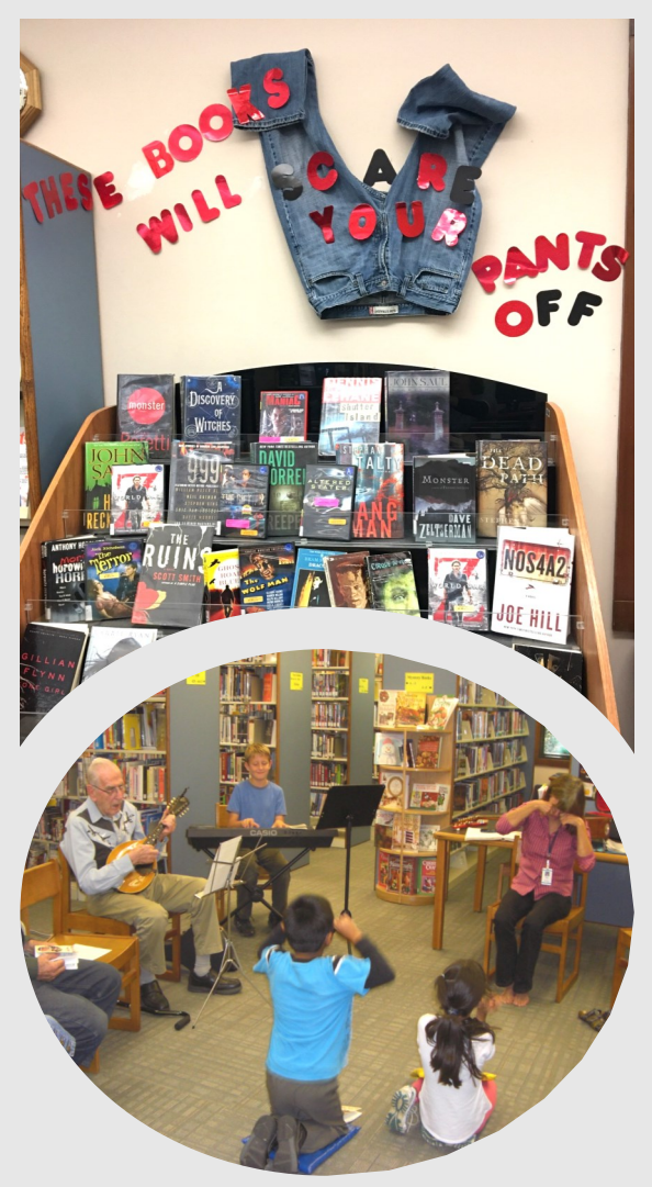
Patrons enjoy the tune "Babies on the Bus" during Edneyville's Old-Time Sing-a-Long.