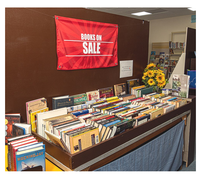
Half-price sales table at FOL bookstore