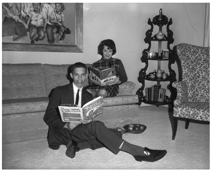
The Community Foundation grant has allowed photographs like this 1963 image of students at Hendersonville High School to be preserved and made accessible to the public. To see more photos like this one, come to the Baker-Barber Collection viewing in the Kaplan Auditorium on the 1<sup>st</sup> and 3<sup>rd</sup> Thursdays of every month at 1:30pm.