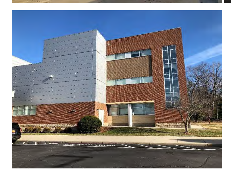
(Page 1 of 2)