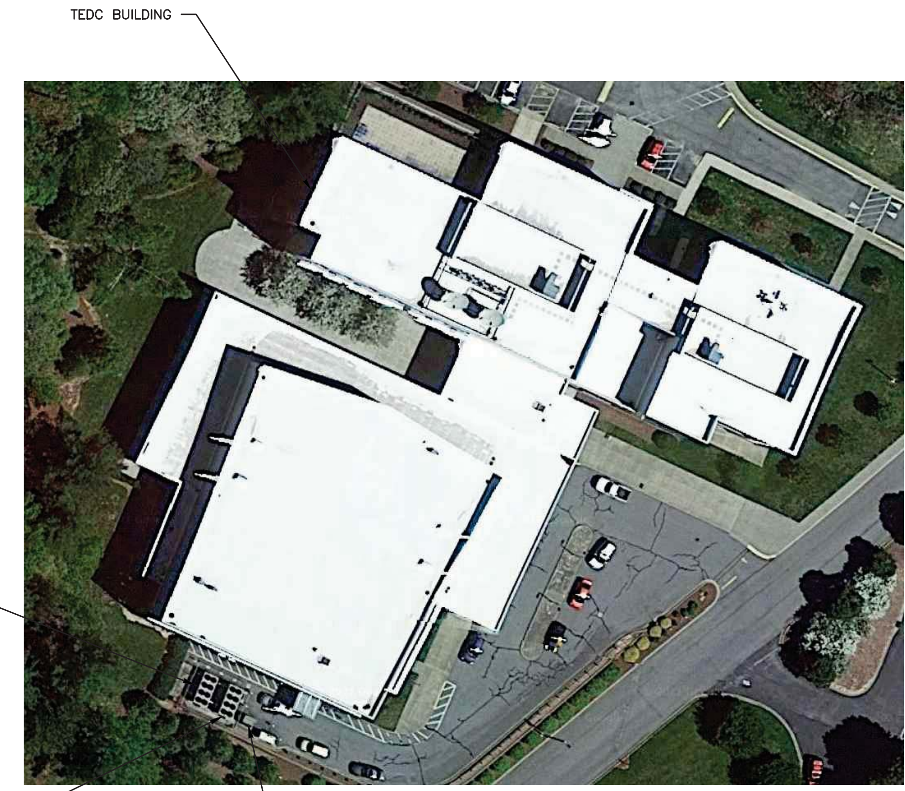
TEDC BUILDING CHILLER LOCATION PLAN - FOR REFERENCE ONLY SCALE: NONE

NOTES: 1. FOR CARRIER CHILLER INFORMATION PLEASE CONTACT: MARK VARADI - APPLIED EQUIPMENT SALES ENGINEER CARRIER CORPORATION MARK.B.VARADI@CARRIER.COM CELL: 336-709-0089 FAX: 860-622-3749 OR ANDREW TOWNSEND - SALES ENGINEER CARRIER COMMERCIAL SYSTEMS ANDREW.TOWNSEND@CARRIER.COM CELL: 704.680.7854 E-FAX: 860.755.8811