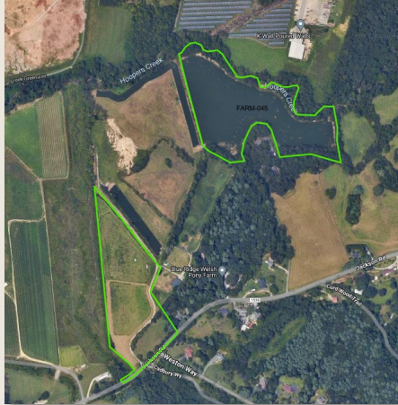
Skybrook Farm 50 acres