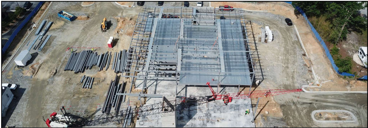
Spartanburg Highway MOB