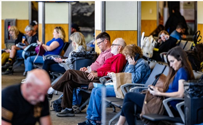
Passengers wait to board flights in gate area at Asheville Regional Airport.