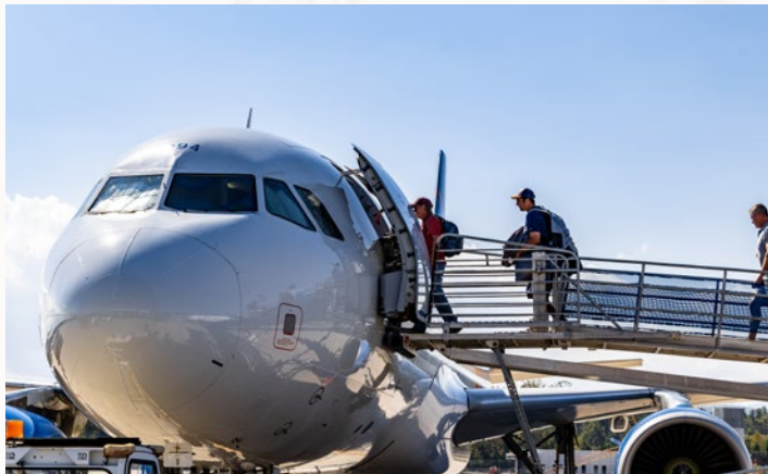
Passengers boarding flight during AVL Forward project, as new terminal is being constructed.