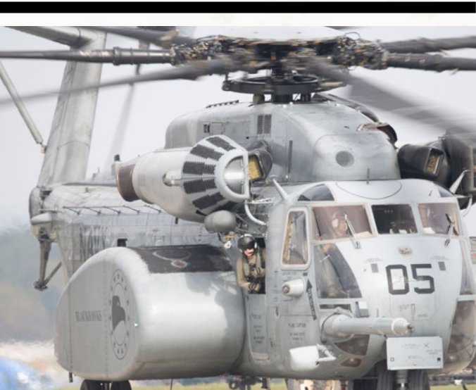
Military aircraft operations taking place on general aviation ramp at Asheville Regional Airport during Hurricane Helene emergency response efforts.