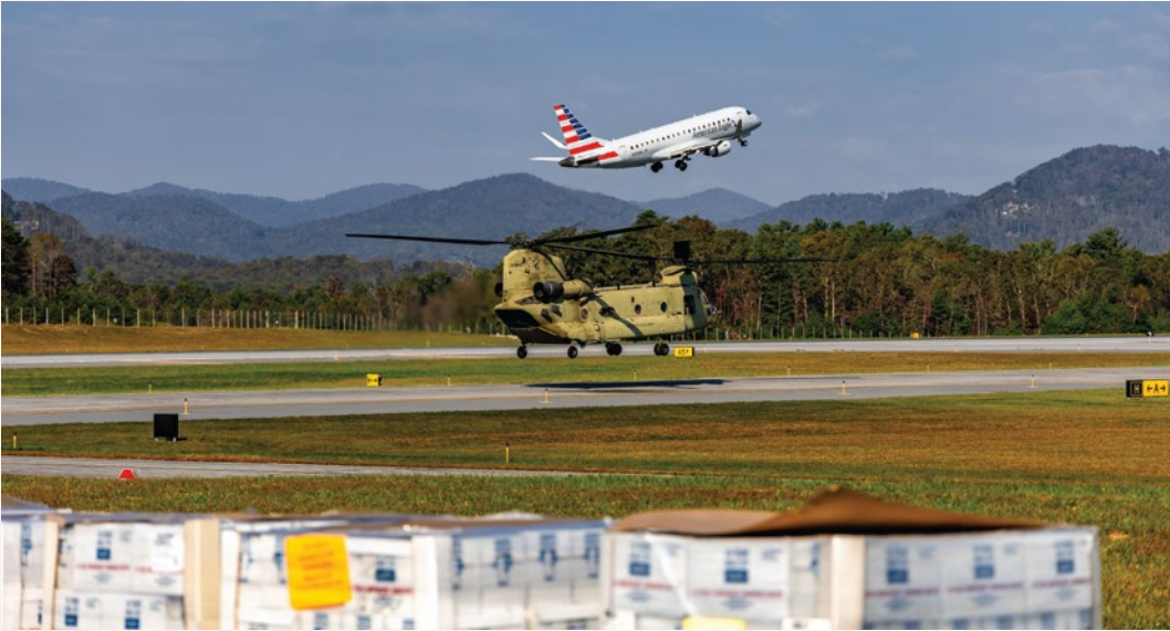
Airport serves as critical gateway for relief efforts happening throughout the western North Carolina region after Hurricane Helene.