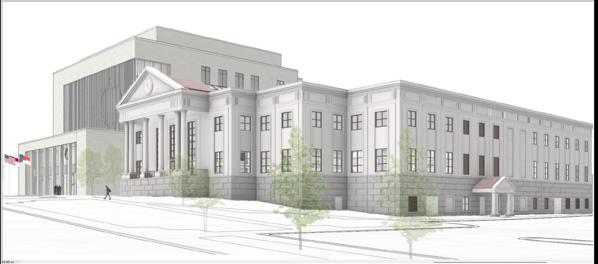
Henderson County JCAR Project