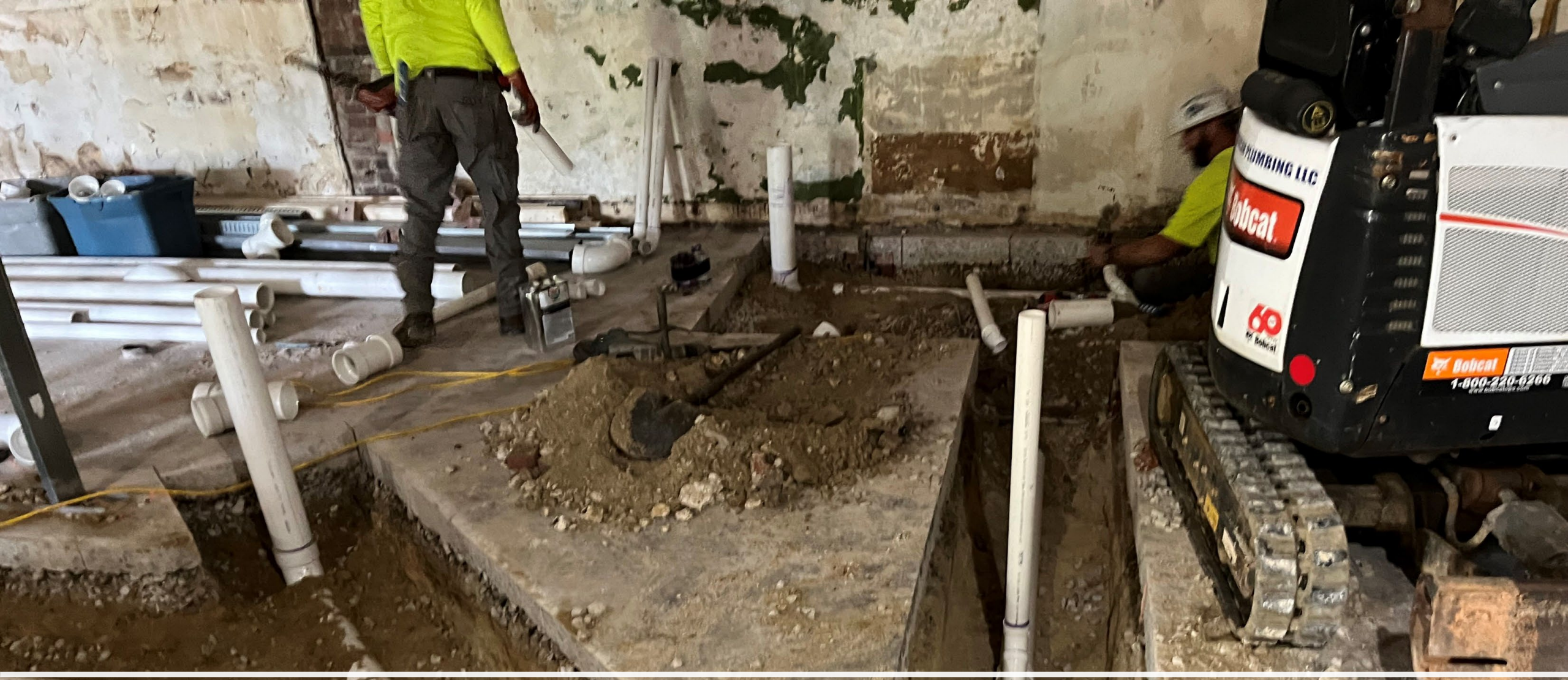
HC Veteran Services Office