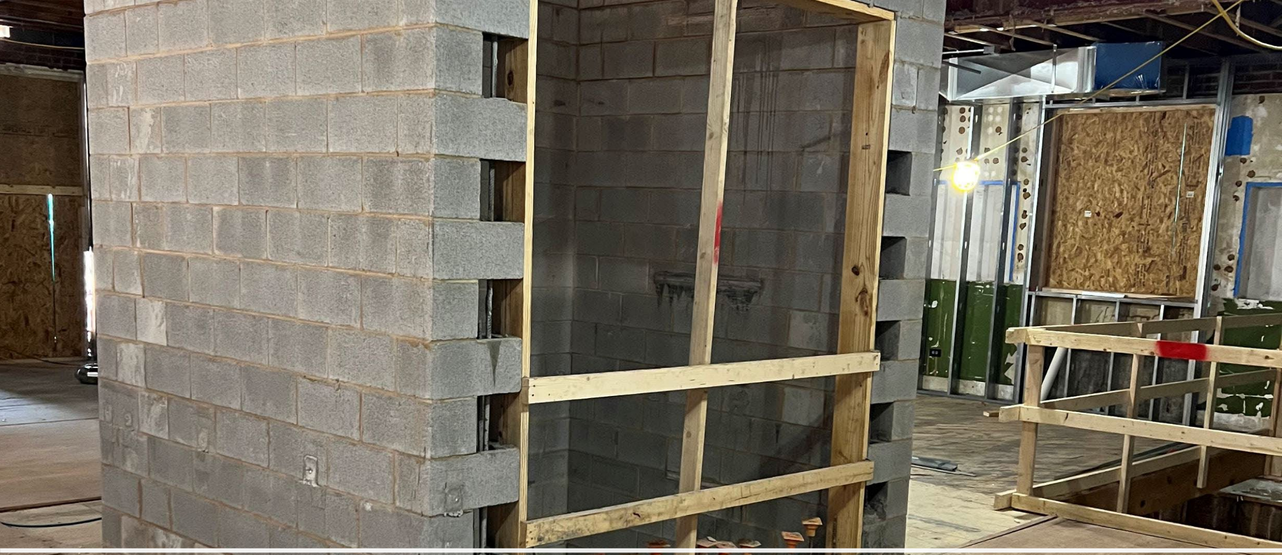
HC Veterans Services Office