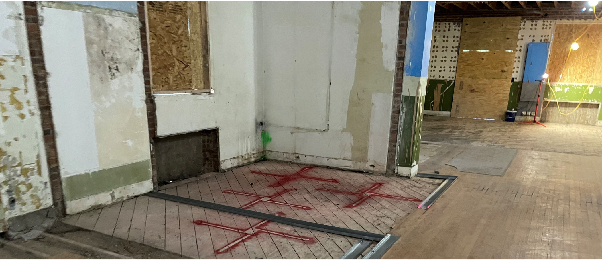
HC Veteran Services Office