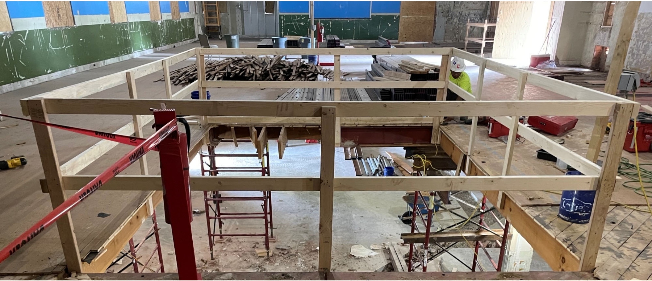
HC Veteran Services Office