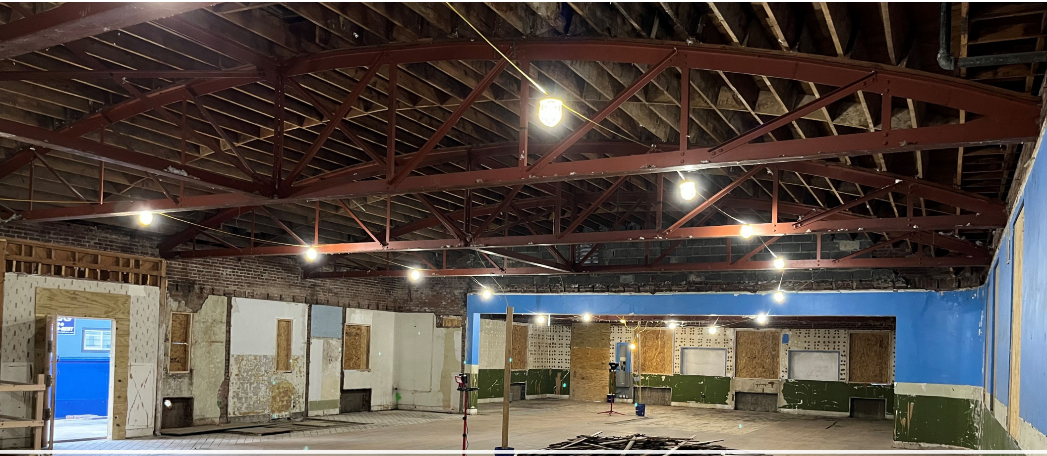
HC Veteran Services Office