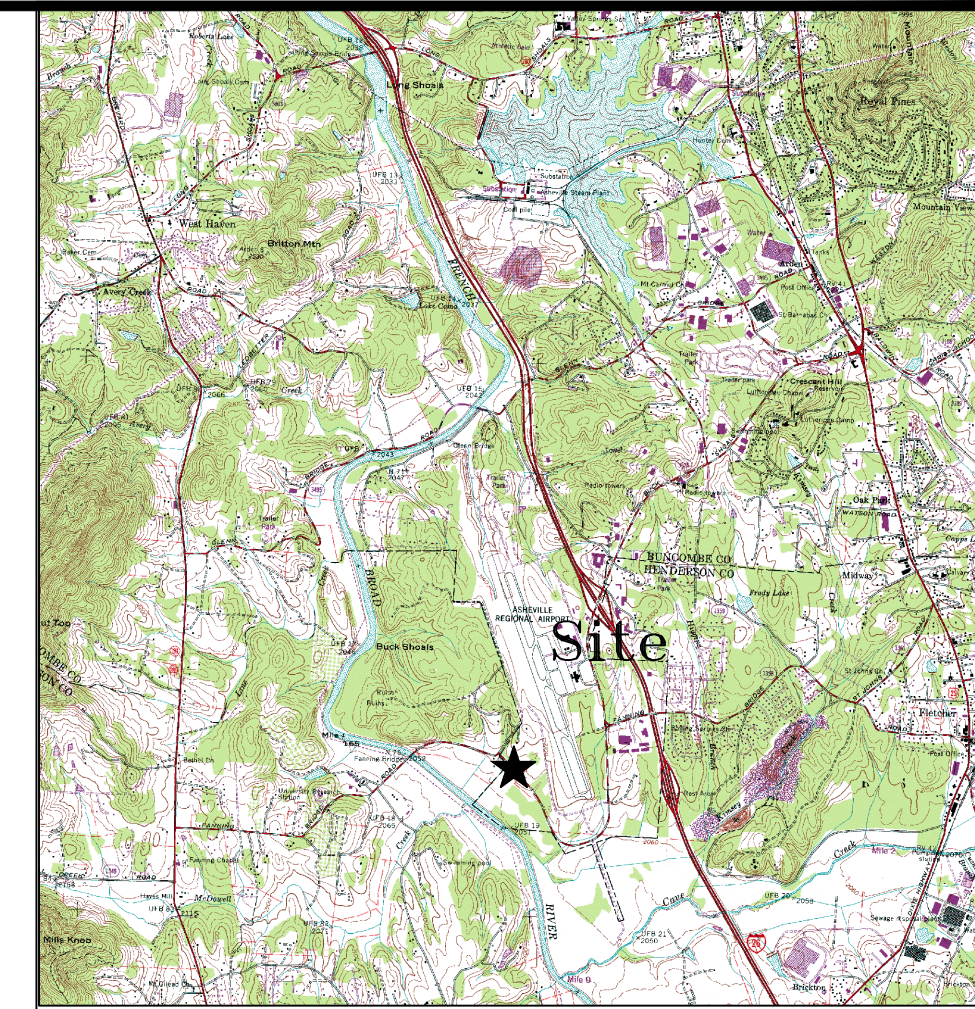
Location Map n.t.s.