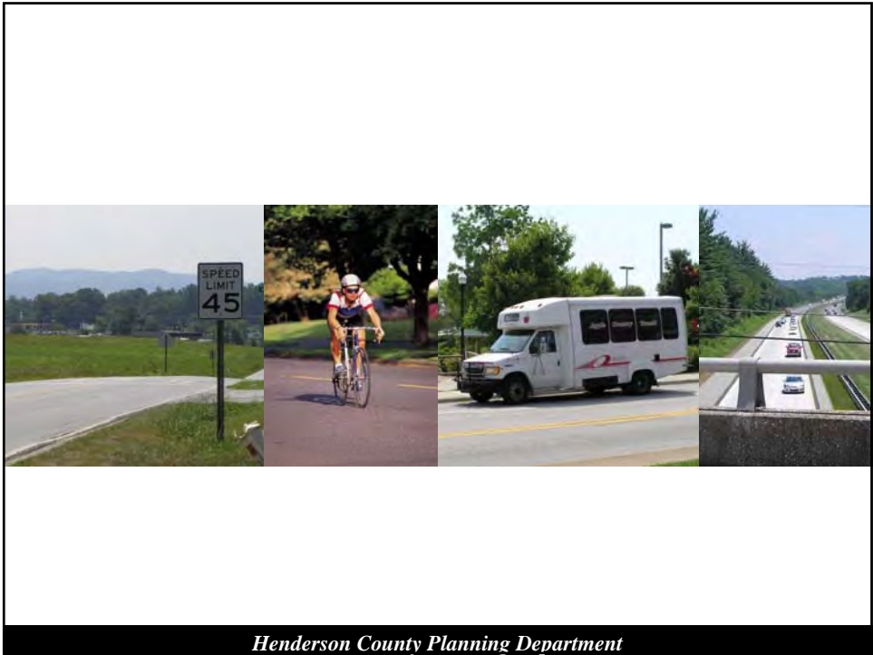
Henderson County Planning Department