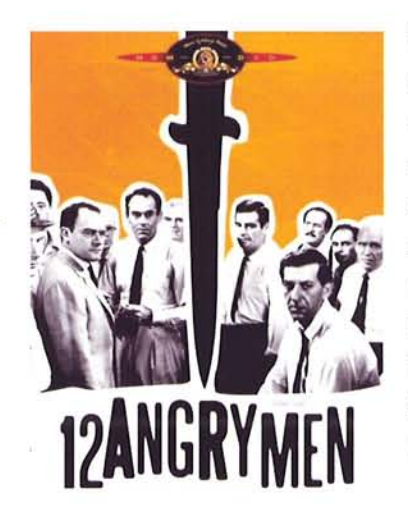
Original Movie Poster

The play focuses on a jury's deliberations in a capital murder case. A 12man jury is sent to begin deliberations in the firstdegree murder trial of an 18-year-old Latino accused in the stabbing death of his father, where a guilty verdict means an automatic death sentence. The case appears to be open-and-shut: The defendant has a weak alibi; a knife he claimed