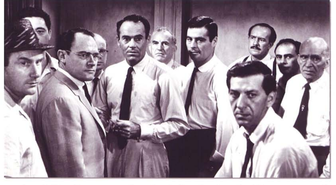
murder trial is guilty, while one juror stands up courageously for what he believes is justice and tries to persuade the

believe beyond a reasonable doubt that the defendant is guilty. As the deliberations unfold, the story quickly becomes a study of the jurors' complex personalities (which range from wise, bright and empathetic to arrogant, prejudiced and merciless), preconceptions, backgrounds and interactions. That provides the backdrop to Mr. Davis' attempts in convincing the other jurors that a "not guilty" verdict might be appropriate.